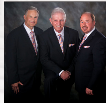
The Guardians Gospel Music Night June 24, 2017 • 6:30 p.m.